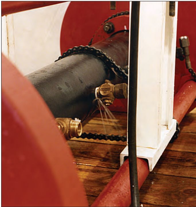
Richard W. Bonds / C. James Clark / Daniel W. Crabtree

Cantilever load testing was conducted to evaluate the strength of the threaded connections of the two pipe materials. The procedure was similar to that used for the pull-out tests, the only difference being the specimens were rotated 90 degrees and a slightly different connection apparatus to the corporation stops was used. This apparatus had a pivot type connection point at the corporation, which allowed a deflection of approximately 15 degrees. Each cantilever test was done in increments of 25 psi hydraulic pressure, which was later converted to inch-pounds bending moment at the interface between the pipe and corporation stop. Failure was defined by the loss of pressure being applied.