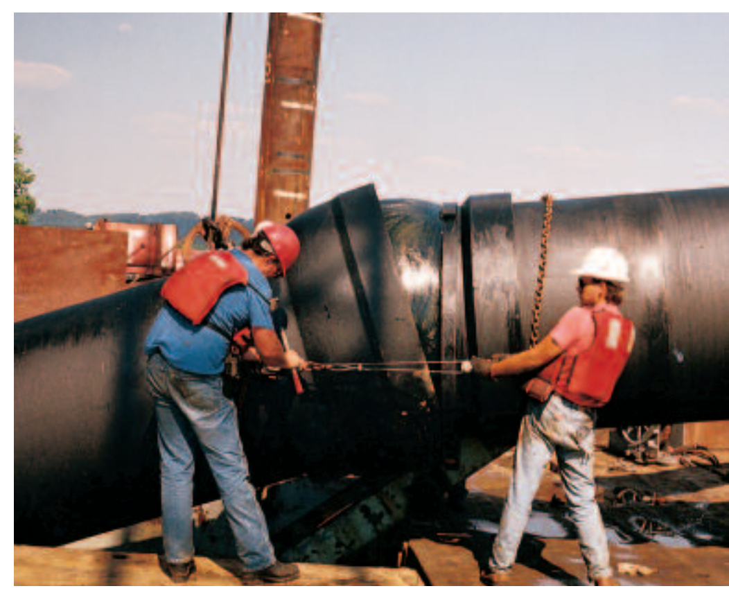
Above: Workers use come-alongs while installing Ductile Iron pipe with boltless ball and socket joints. These joints consist of a precision-machined ball that fits into a precision-machined socket, a rubber gasket that provides a pressure-tight seal, and a retainer ring that provides longitudinal restraint. The joint is leak-free throughout the full range of deflection.

Maximum deflection is 15^{\circ} per joint in sizes up to and including 24-inch pipe; in sizes 30-inch and larger, maximum deflection varies from 12^{1}/_{2^{\circ}} to 15^{\circ} . At maximum deflection, the joint remains pressure-tight and retains the full flow area available in the undeflected joint.